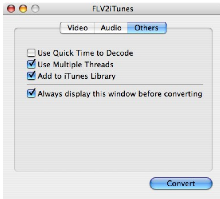
Figure 4. Conversion Settings Dialog Box (Others)