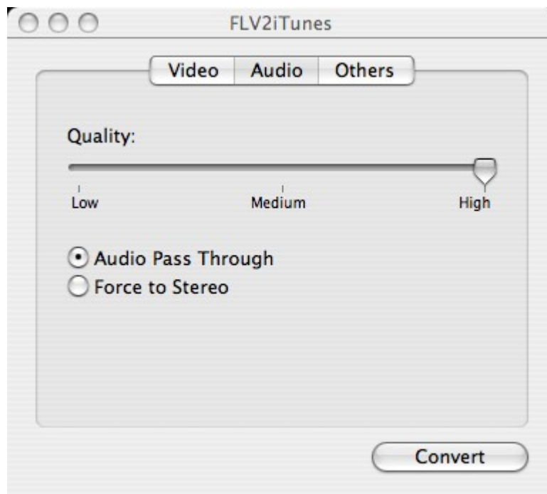
Figure 3. Conversion Settings Dialog Box (Audio)